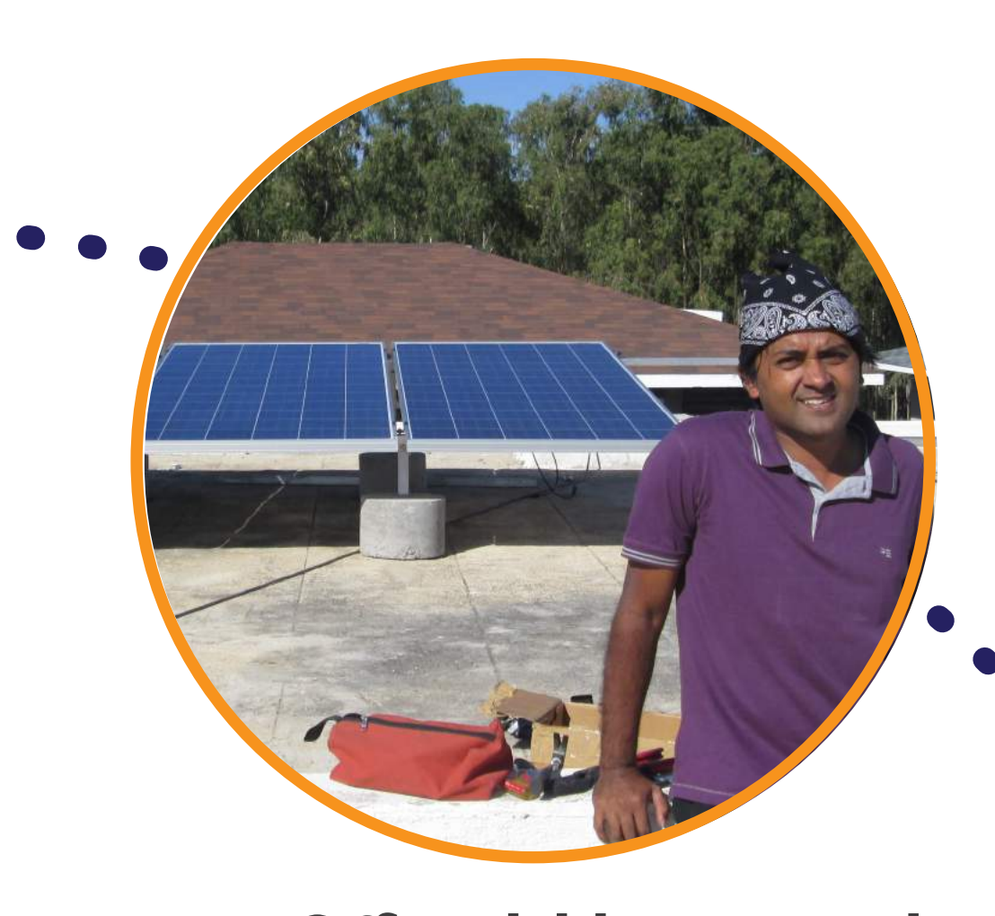
2013 Off-grid home solar system in Bangalore Built a 3kWp system woth a state of art inverter from the Swiss company, Studer