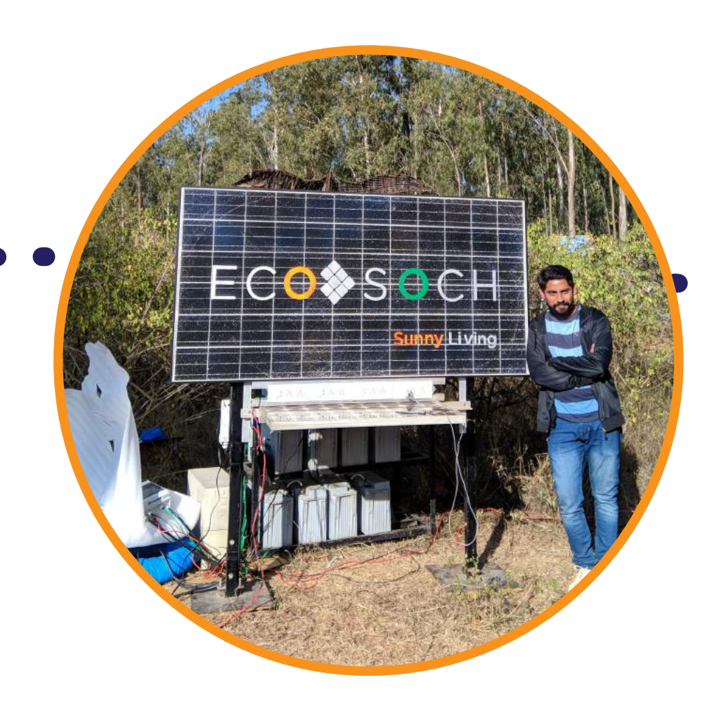
2017 Solar powered stage for Echoes of Earth - India's greenest music festival