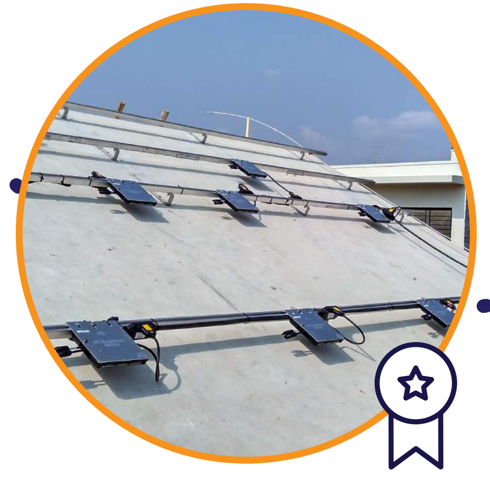
2016 First net metered micro inverter system in

Karnataka At a residence in Ferns Paradise, Bangalore