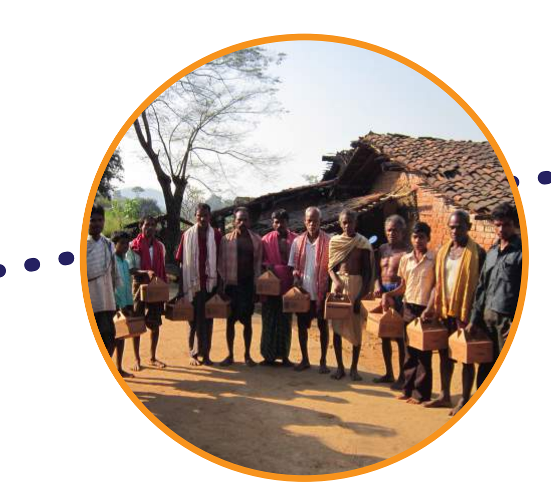
2011 Rural lighting project in Balangir Providing solar portable lights for 25 households in a rural hamlet in Balangir district, Odisha