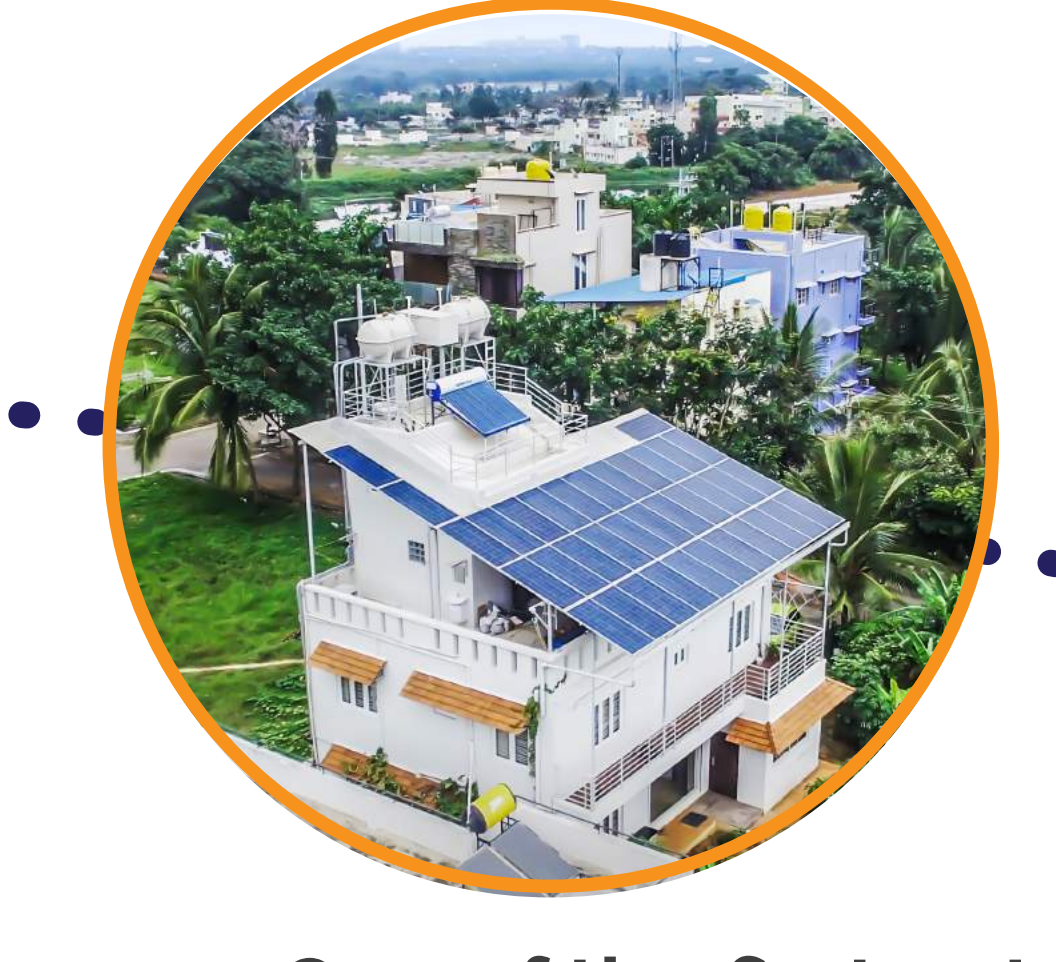
2015 One of the first net metered on-grid system in Karnataka

A 10 kWp system was installed at Neel Mathew's (Power-packed man) residence in Jigani