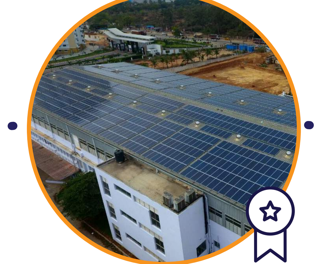
2016 First CEIG approved DG (Diesel Generator) integration system in Karnataka - Ranger Apparel 391 kWp