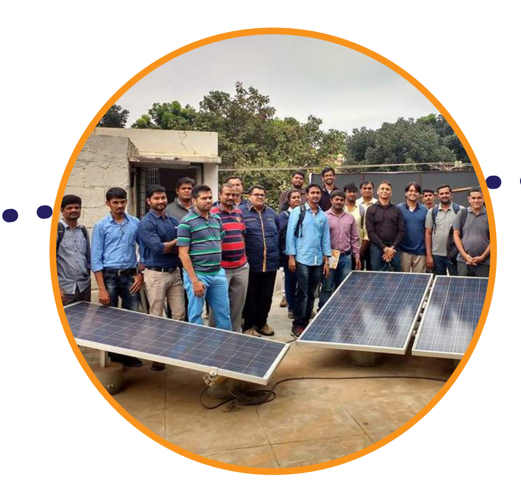
2016 Started conducting full day workshops for solar awareness