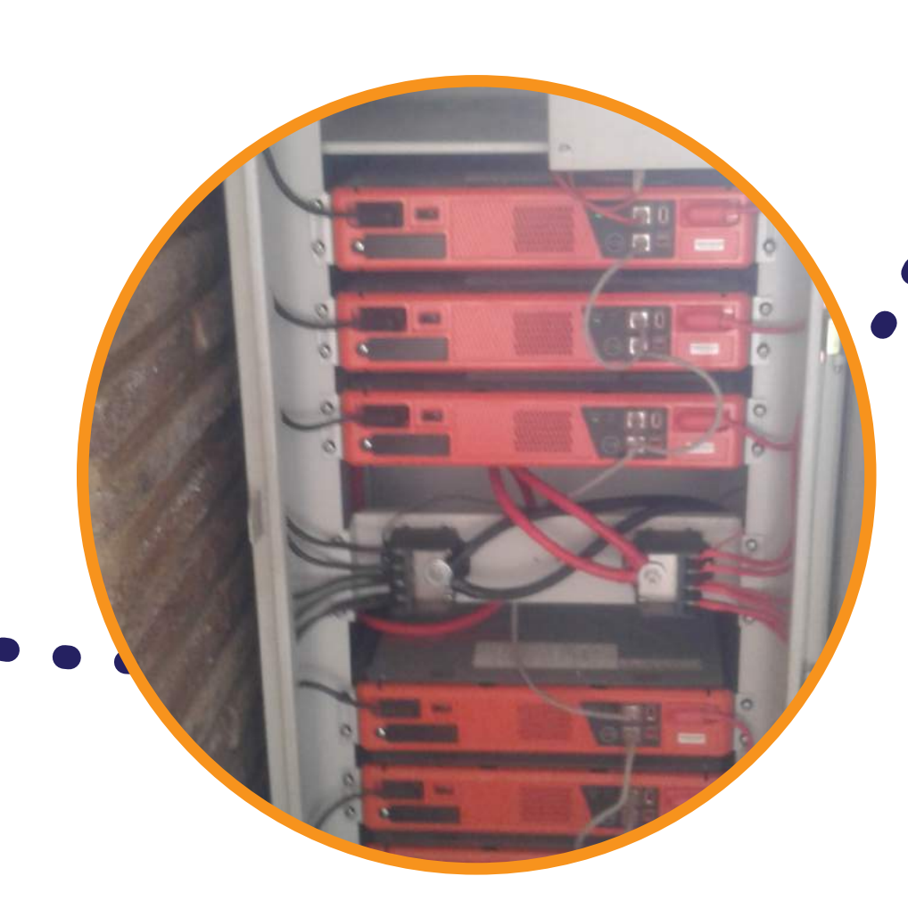
2018 Lithium ion battery based pilot project with solar in Bangalore