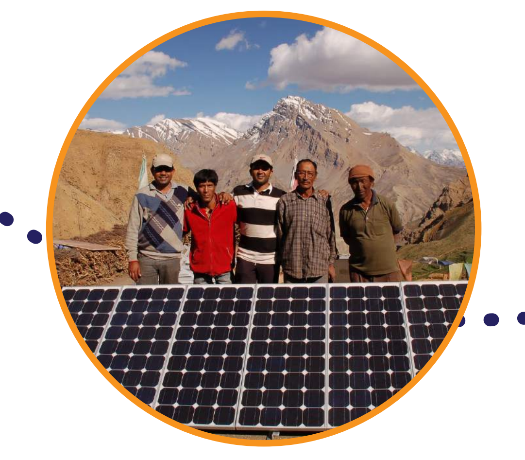
Micro-Grid at Demul Demul, Himachal Pradesh is one the highest altitude villages in the world at 14,000 ft. The solar PV system supports lighting for 50 households