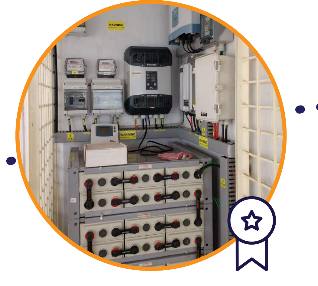
2016 First AC coupled system in Bangalore At, Dollar's Colony, JP Nagar

Karnataka At a residence in Ferns Paradise, Bangalore